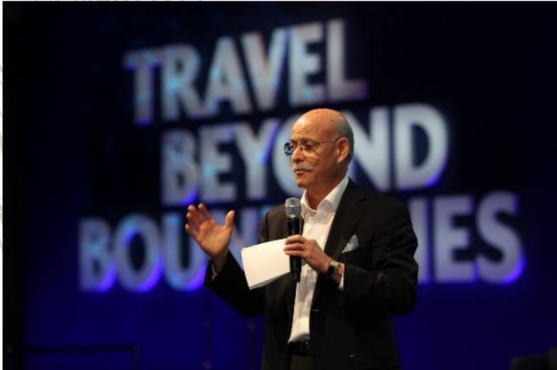
Jeremy Rifkin, Advisor to the European Union, President of the Foundation on Economic Trends

“We could lose half of all species on the planet in the next 70 years”